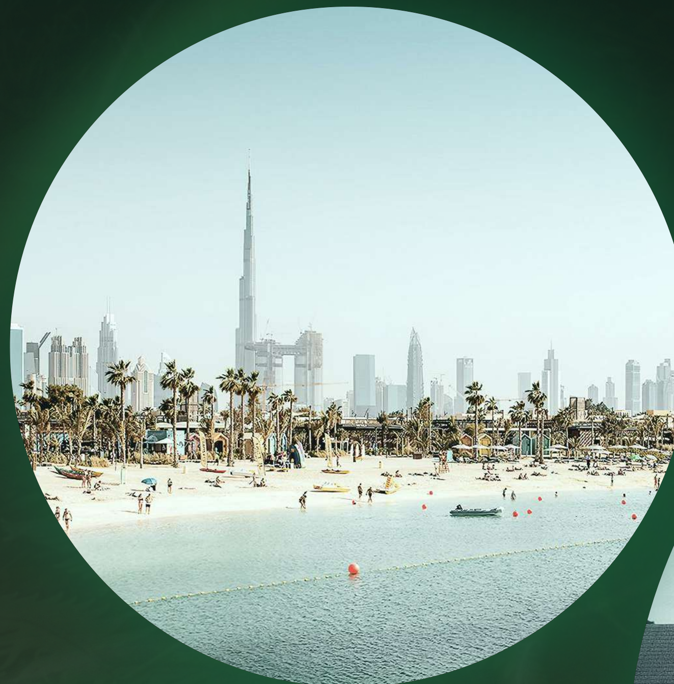
LA MER BEACH