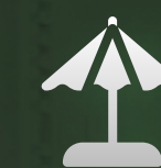
LA MER BEACH