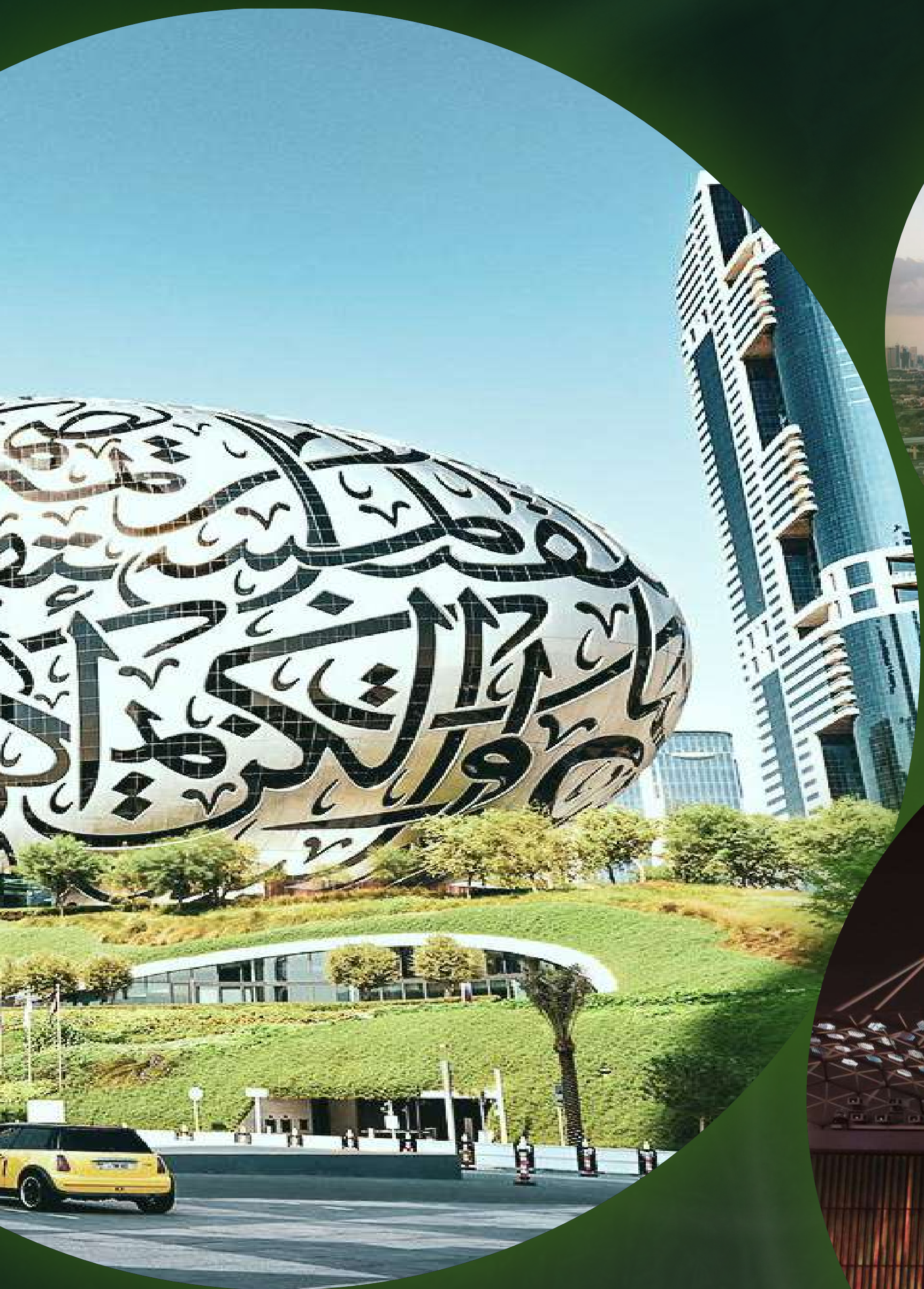
MUSEUM OF THE FUTURE